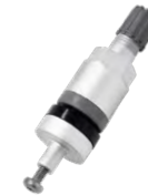
Silver Clamp-In: 6-266B