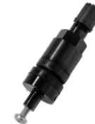
Black Clamp-In: 6-266B-BK