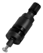
Graphite Clamp-In: 6-266A-SH

The Hybrid NFC and Hybrid 2.5 have four valve stem options: the most popular aftermarket Snap-In and three Clamp-In valves designed to complement the alloy wheel finish.